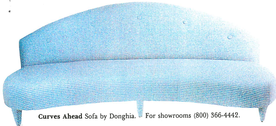
Curves Ahead Sofa by Donghia. For showrooms (800) 366-4442.