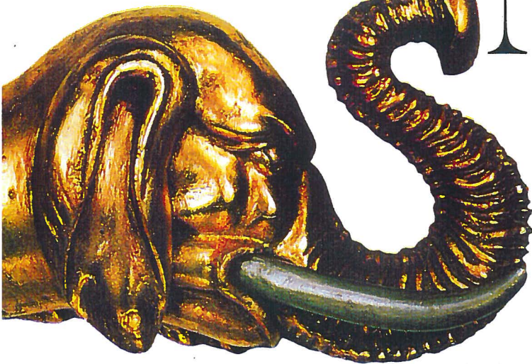
Jumbo Giant gilded elephant's head finial ( above ) at George Smith, 73 Spring St., NYC (212) 226-4747.